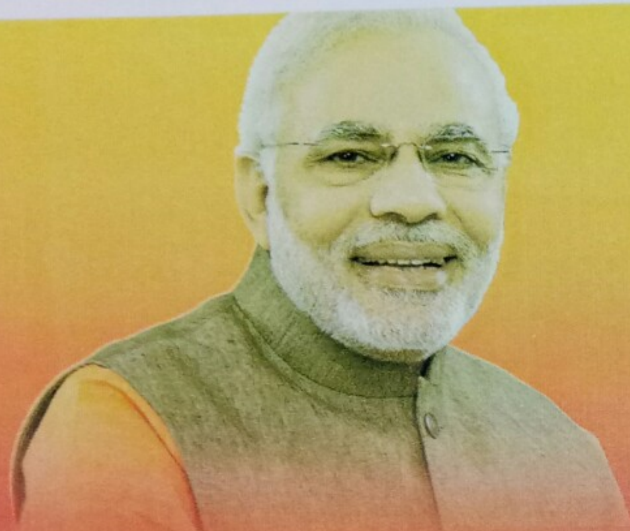
Shri Narendra Modi Hon'ble Prime Minister of India

Ministry of Petroleum & Natural Gas Government of India